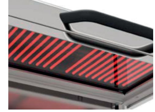
Infrared heating elements, glassceramic sheet.

All Blue Seal Rapid Heat/Rise & Fall Grills are made from stainless steel. Thanks to their small rubber feet, they can rest against counters or they can be fixed to walls using specific stainless steel supports. To ensure safety, each model features air vents, outlets for heat and fumes.