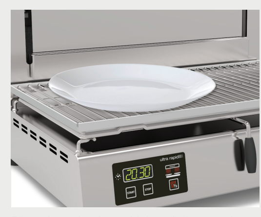
Plate detecting bar which switches on the Rapid Heat/Rise & Fall Grill as soon as the plate is placed in the appliance.