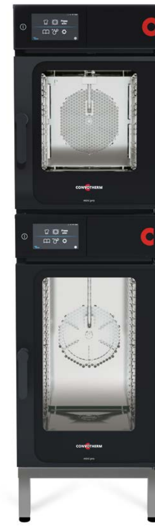
mini pro 6.10 + 10.10