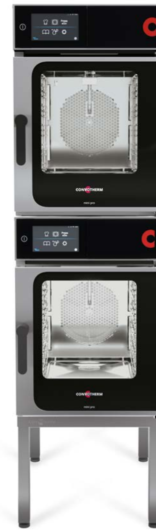
mini pro 6.10 + 6.10

The mini pro delivers unmatched versatility with the widest range of cooking modes, from frying to sous vide, making it a valuable replacement for multiple pieces of kitchen equipment.