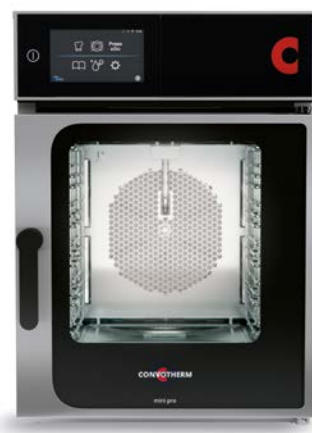
mini pro 6.10