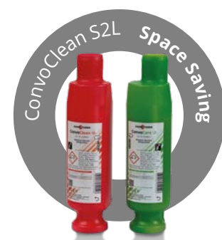
mini pro 6.06