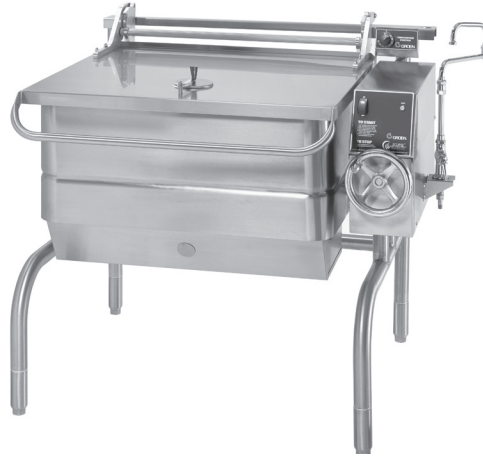
Model BPM-40G shown

A heavy-gauge, fully-adjustable one-piece cover is standard with torsion bar type counterbalance designed to maintain the selected cover position. A vent is provided in the cover top to regulate condensate buildup and a rear condensate drip shield is located under the cover to prevent condensate from dripping on floor when cover is opened.